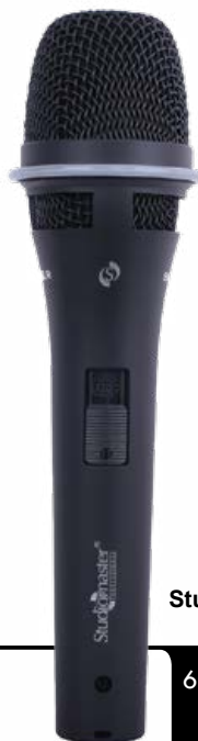
Studiomaster Professional SM 650XLR

features a unique suspended cartridge shock-mount system that minimizes handling noise. The microphone boasts of a low failure magnetic on/off switch, a rugged body and dent-proof grill that withstands physical shocks. With a wide frequency response of 30Hz-17KHz, the SM 650XLR is sure to be